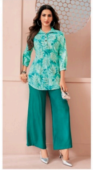
D No. 507