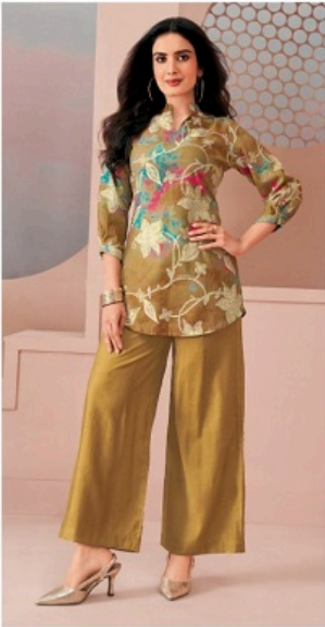
D No. 508