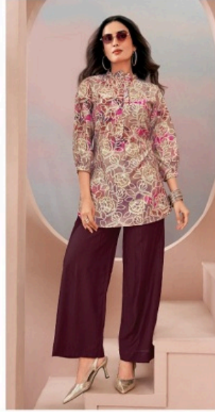
D No. 506