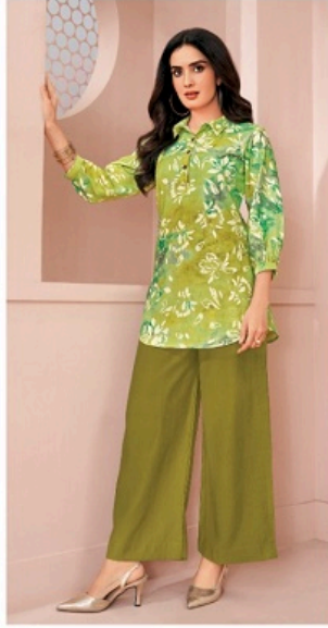
D No. 505