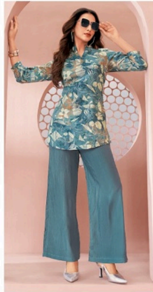
D No. 510