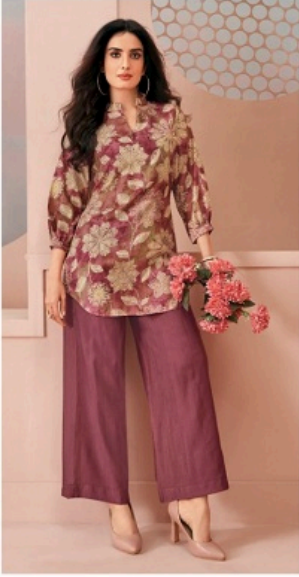
D No. 504