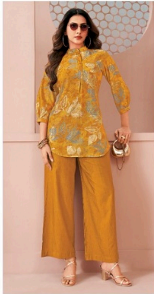
D No. 509