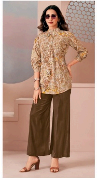
D No. 511