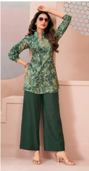
D No. 512