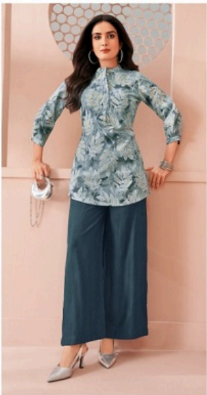
D No. 513