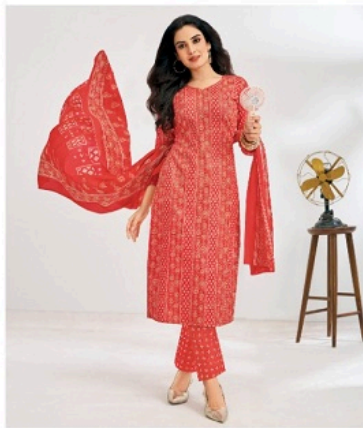
D No. / 015