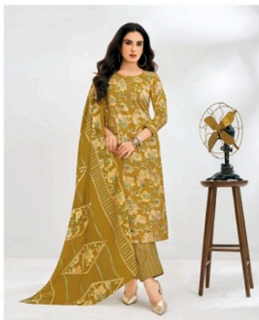
D No. / 017