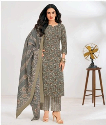
D No. / 011