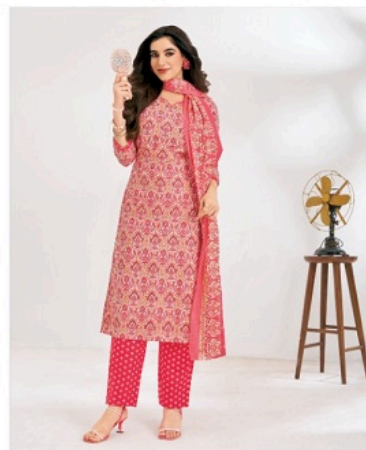
D No. / 018