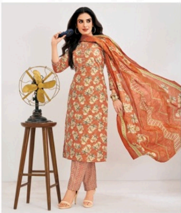
D No. / 014