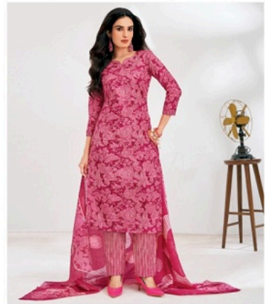
D No. / 013