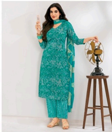
D No. / 012