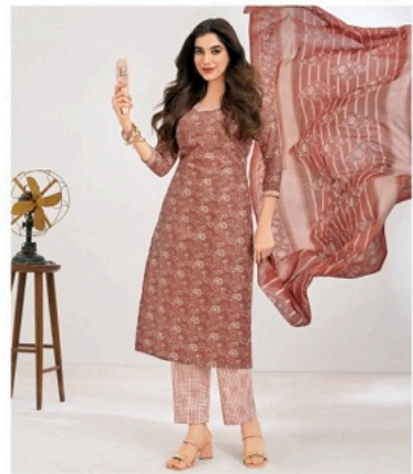
D No. / 016