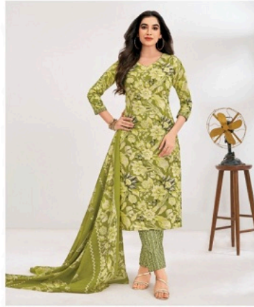
D No. / 010