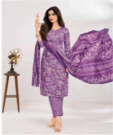
D No. / 009