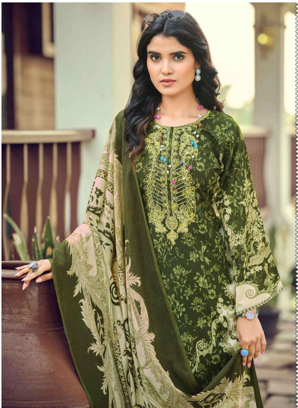
The epitome of grace