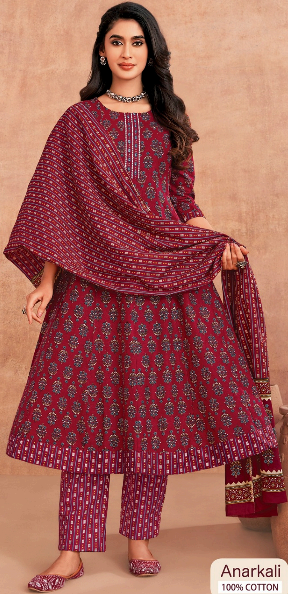
Anarkali 100% COTTON