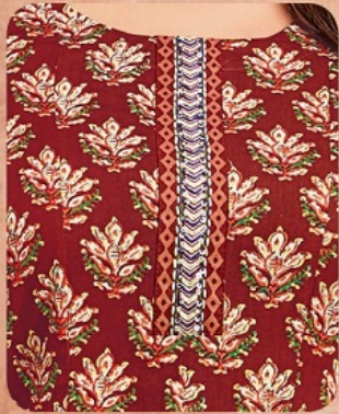
Anarkali 100% COTTON