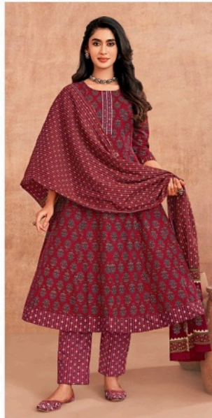
D No. 1112