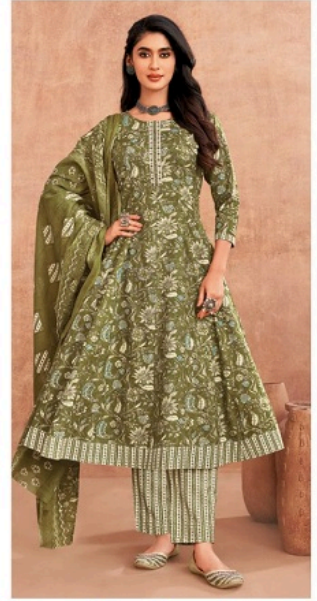
D No. 1110