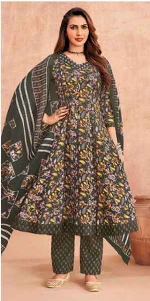
D No. 1111