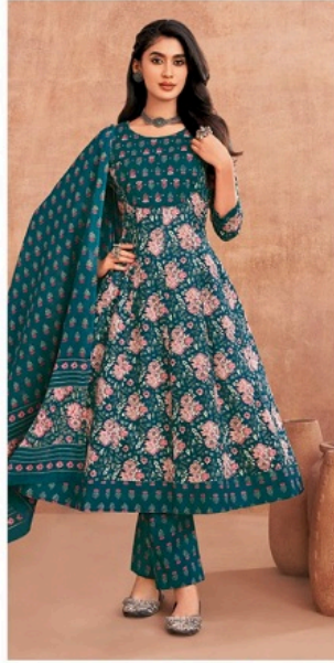
D No. 1108