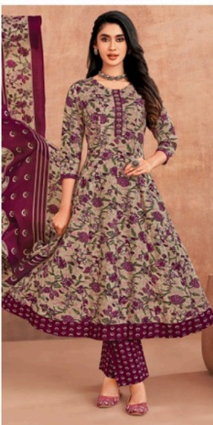
D No. 1115