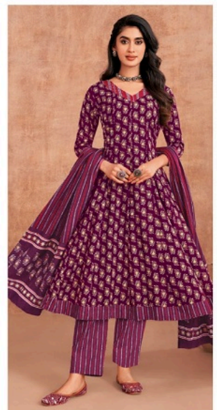
D No. 1116