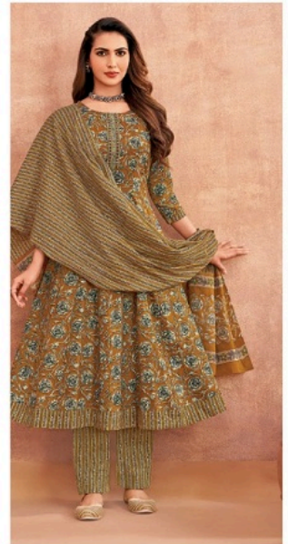
D No. 1114