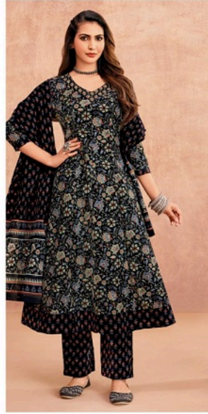
D No. 1109