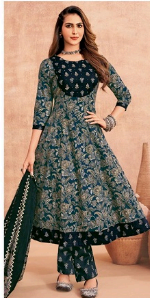
D No. 1113