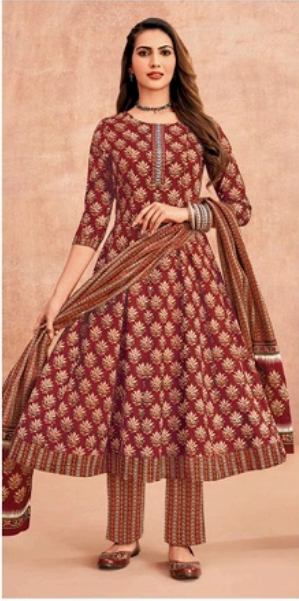
D No. 1107