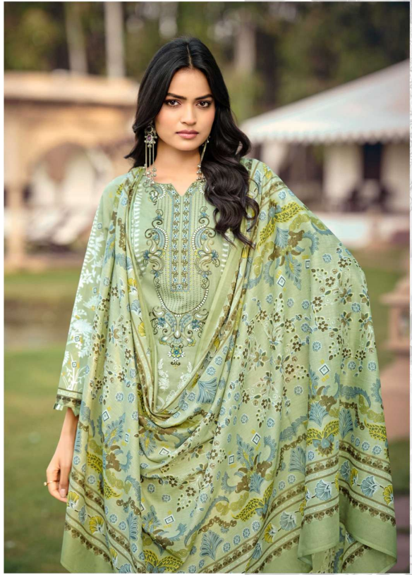
◆◆◆ Embrace the dainty detail, while you adorn this suit set with dupatta. ◆◆◆