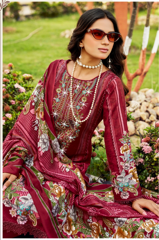
The Language of Style