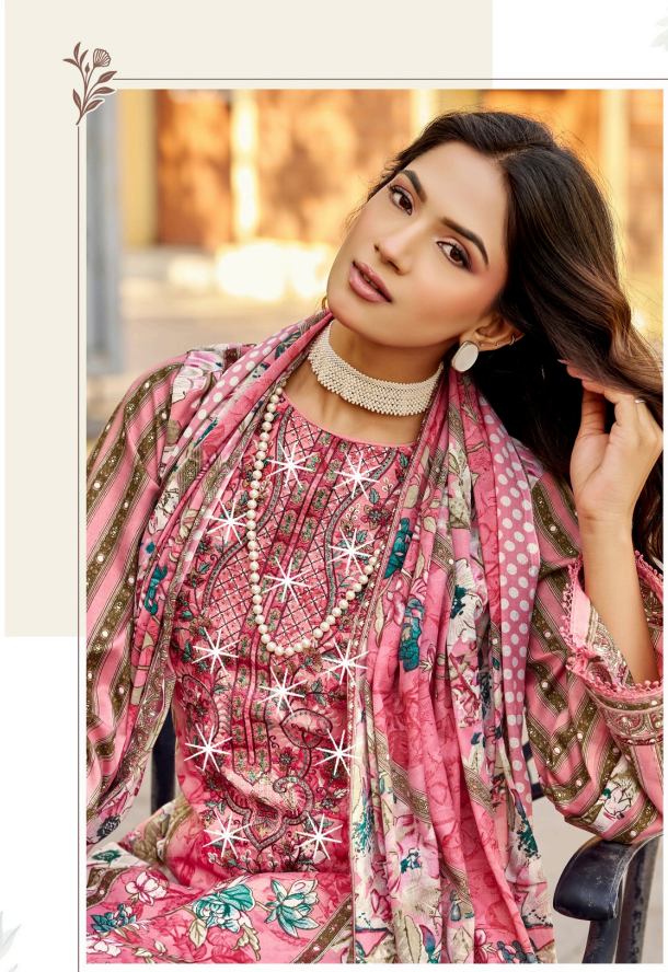
Defined by Elegance