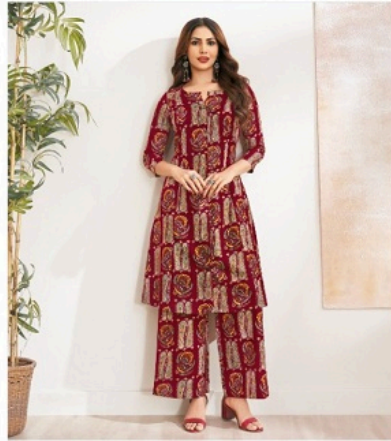
D No. 207