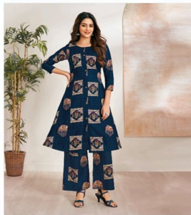
D No. 213