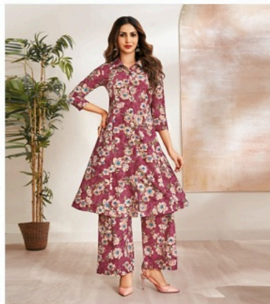
D No. 215