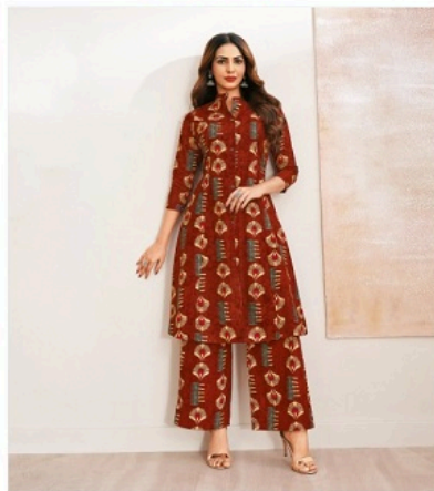
D No. 212