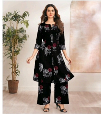
D No. 208