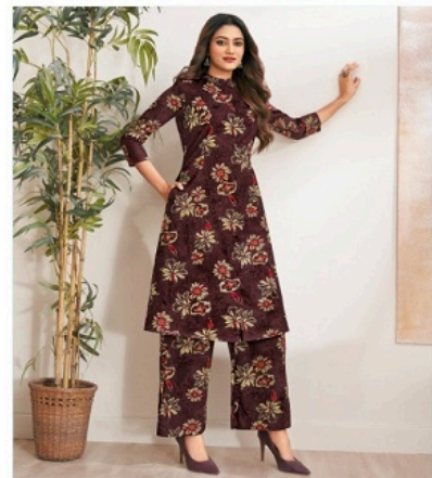
D No. 216