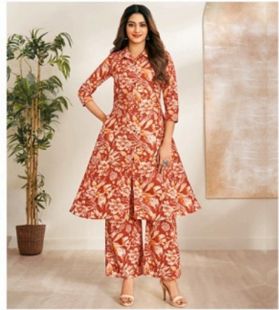
D No. 211