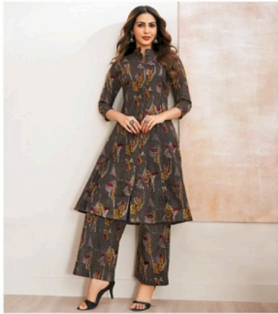
D No. 210