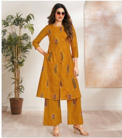
D No. 209