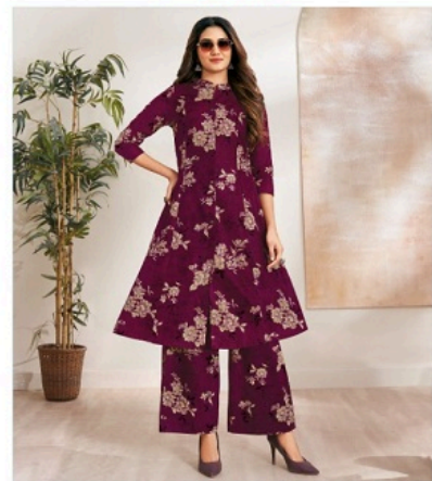
D No. 214