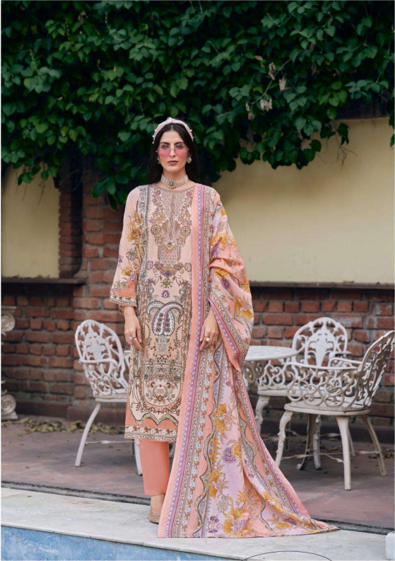
I MAKE CLOTHES, WOMEN MAKE FASHION 929 - 005